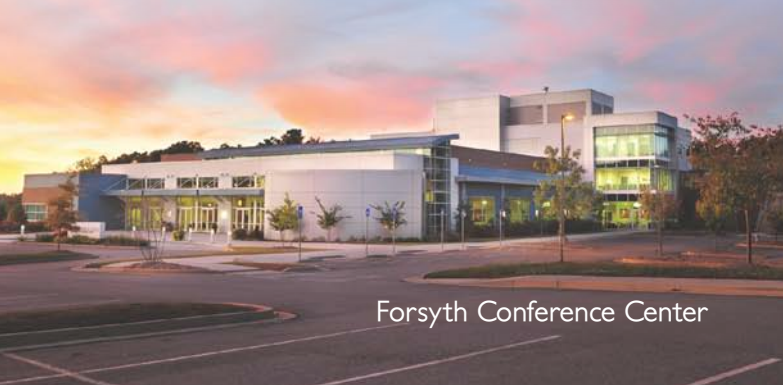
Forsyth Conference Center

Cumming-Forsyth accommodates every need, whether you are planning a sporting tournament, corporate meeting, reunion or wedding. Group-friendly restaurants and affordable, safe lodging offer the comforts of home while top-notch facilities host your group with style. Outdoor team-building courses, shopping excursions to unique boutiques and outings on scenic Lake Sidney Lanier make Cumming-Forsyth make it easy to come play in our backyard the next time you need to gather a group.