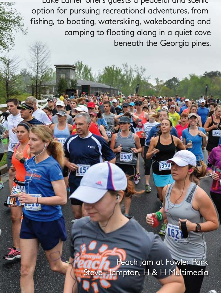
Peach Jam at Fowler Park Steve Hampton, H & H Multimedia

Lake Lanier offers guests a peaceful and scenic option for pursuing recreational adventures, from fishing, to boating, waterskiing, wakeboarding and camping to floating along in a quiet cove beneath the Georgia pines.